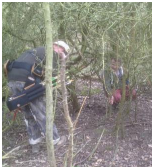
but careful not to miss the target – there are no metal detectors out here!