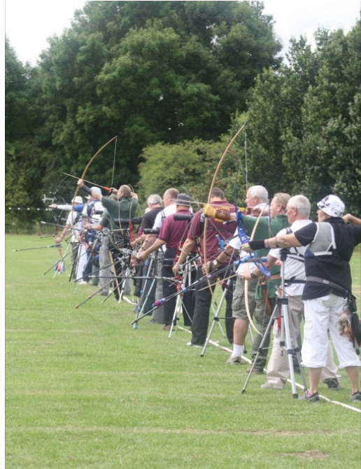
Archers on the line at the Stourbridge Albion