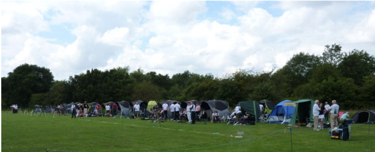
A good turnout at the Rat's Ashes!